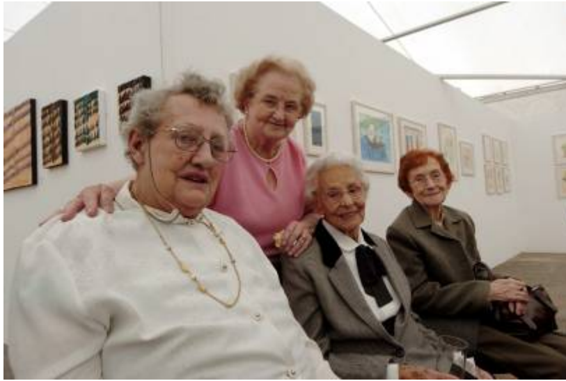
Artists at Between Colours Launch, National Museum of Country Life, May 06