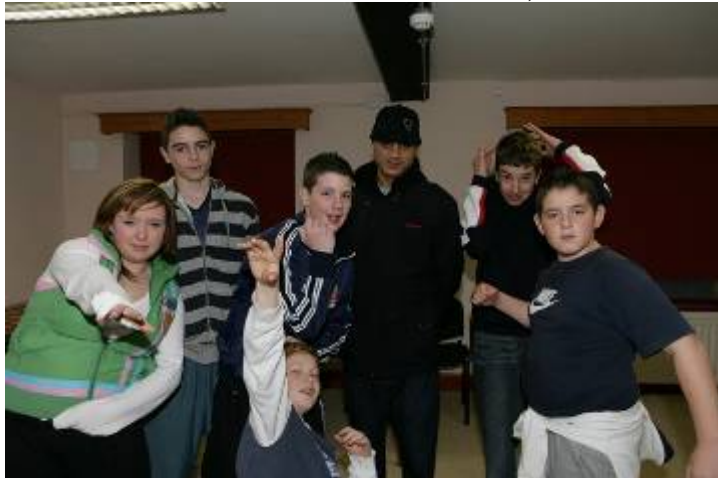
Rapper MC Strategy in Ballina, EXCEL Youth Arts Programme, Nov 06