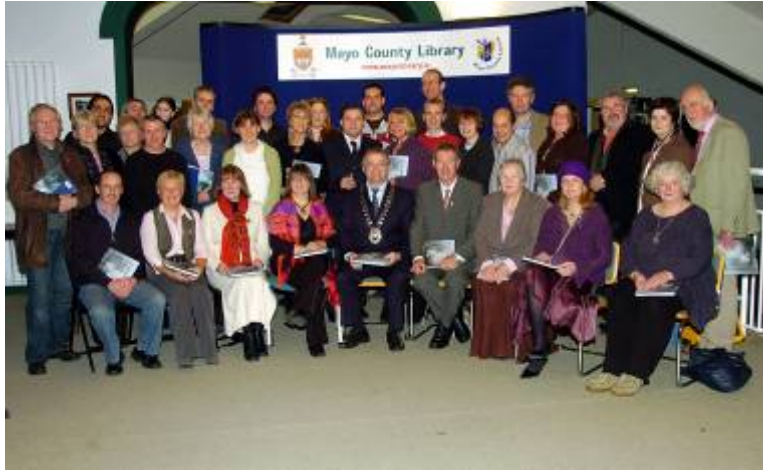
Contributors to 'Present Tense' at launch, Castlebar Library, Nov 06