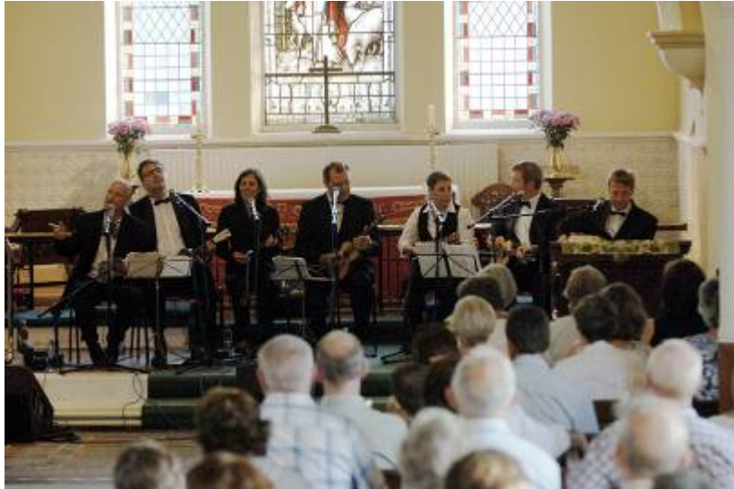
The Ukulele Orchestra of Great Britain, St. Michael's Church, Ballina, July 06