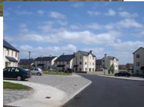
ARD – NA – RI BALLINA