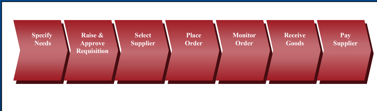
Figure 1: High Level Procurement Transaction Process