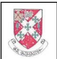
Castlebar Town Council