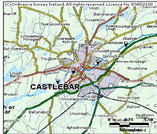
Map Scale 1:62,129

This Flood Report has been downloaded from the Web site www.floodmaps.ie . The users should take account of the restrictions and limitations relating to the content and use of this Web site that are explained in the Disclaimer box when entering the site. It is a condition of use of the Web site that you accept the User Declaration and the Disclaimer.