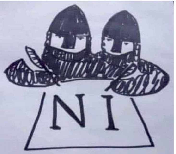
The Knights are drawing In