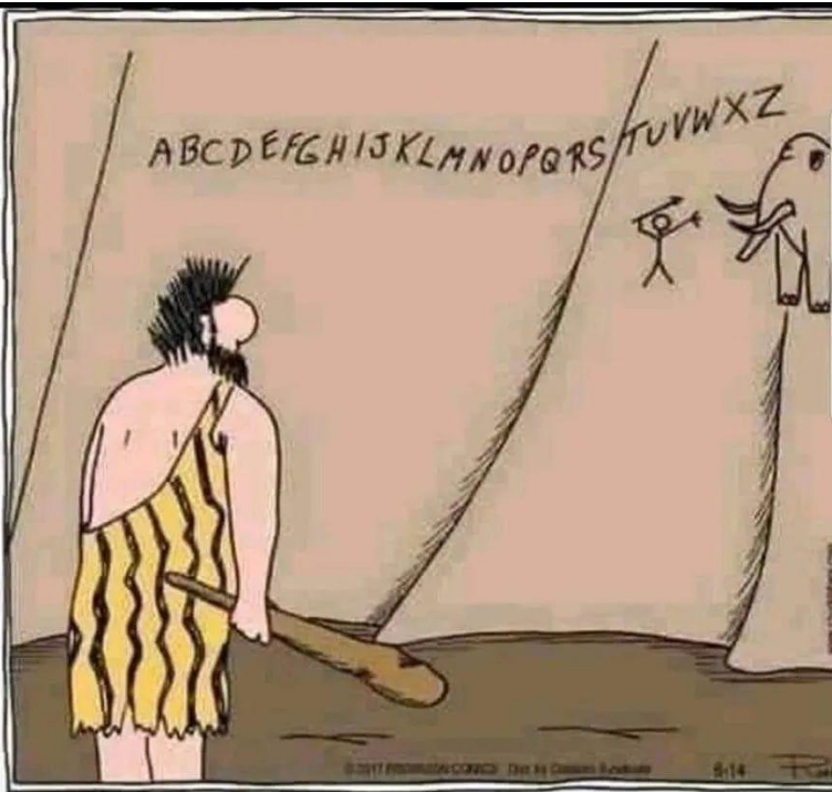
At first there were only 25 letters in the alphabet. Nobody knew why.

I guess the real fact of the matter is... we don't know what tomorrow will bring, and the only thing we really have is... right now. So, don't stay mad for too long. Learn to forgive and love with all your heart. Don't worry about people who don't like you. Enjoy the ones who love you.