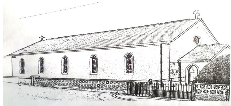
Holy Rosary Church, Glenisland