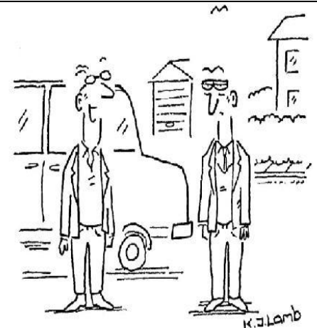
'I'm more of a tank-half-full kind of guy.'