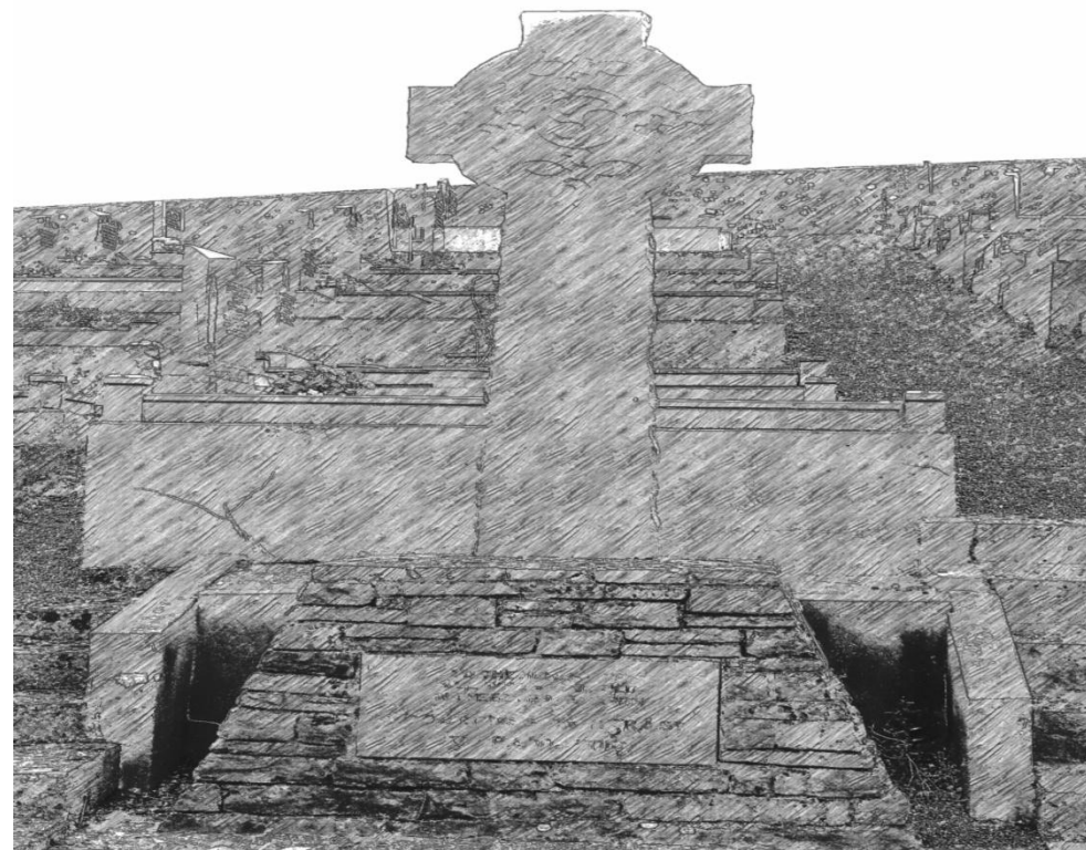
The Memorial Cross in Islandeady Cemetery

Cemetery Weekend in Islandeady and Glenisland Cemeteries 1 st / 2 nd Aug 2020