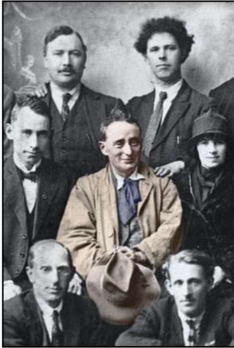
Pádraic Ó Conaire (1882–1928)

Padraic O'Conaire , born in Galway, raised in Connemara, educated in Rockweel and Blackrock colleges. Padraic O'Conaire emerged as the most exciting and widely-read Irish Language writer of his generation while working as a minor civil servant in London.