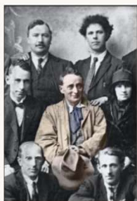
Pádraic Ó Conaire (1882-1928)