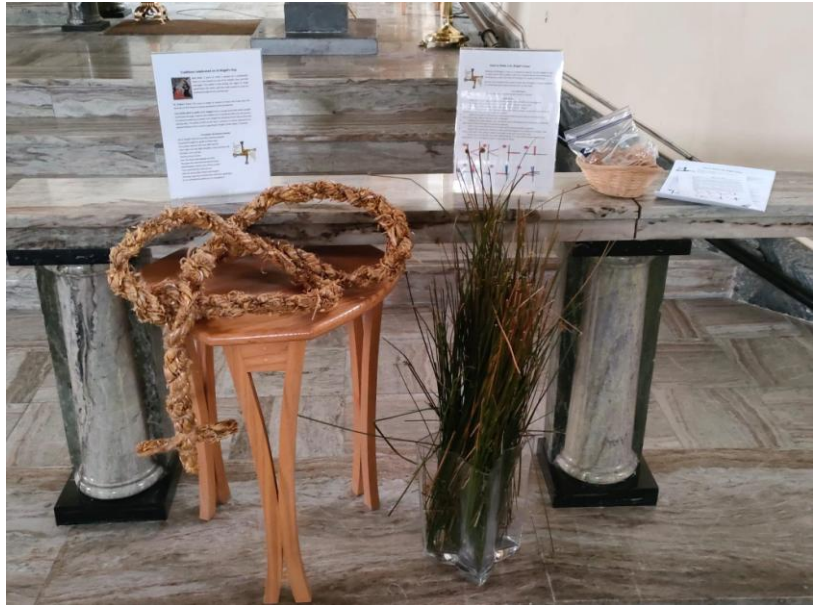
St. Joseph's Church, Shrle

Also there are some rushes for anyone who would like to make their own. Crosses will be blessed as follows: Shrle on Tuesday 1 st February. Glencorrib on Wednesday 2 nd February