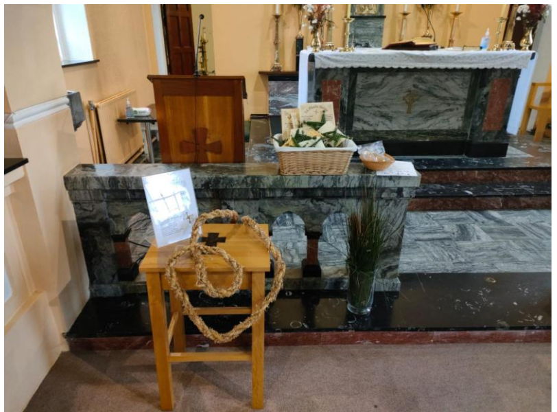
Church of the Immaculate Conception, Glencorrib

PRAYER FOR VOCATIONS: Heavenly Father, we praise you and thank you for all you have done for us. We thank you especially for sending your Son, Jesus Christ, to visit and save us. We ask you to bless our family and all the people of our parish, especially those who are suffering in any way. Encourage those in our parish whom you invite to become priests, religious and permanent deacons, and grant them the generosity of mind and heart to follow your call. May they bring good news to our world today. We ask this through Jesus Christ, our Lord. Amen.