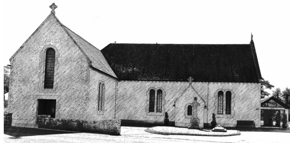
St. Patrick's Church, Islandeady

Sunday 28 th Aug 2022 – 22 nd Sunday in Ordinary Time