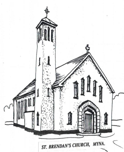
ST. BRENDAN'S CHURCH, MYNA.